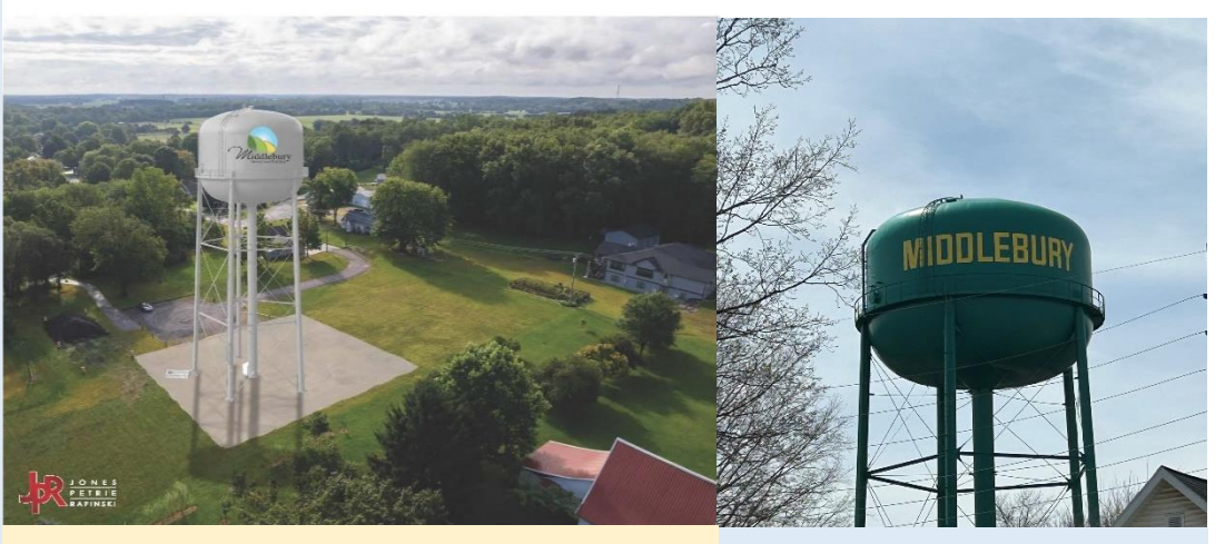
Proposed New Water Tower